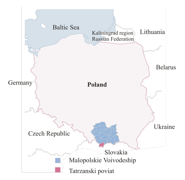
Figure 1. Location against Polish and voivodeships.

pointing out the attempts to include regulations aimed at the reinforcement of investment principles in areas prone to the subsidence of soil masses in local spatial development plans.